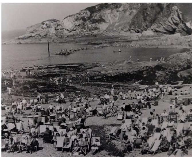
Newberry beach 1950's