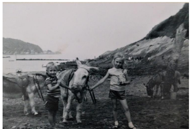
Combe Martin beach 1969