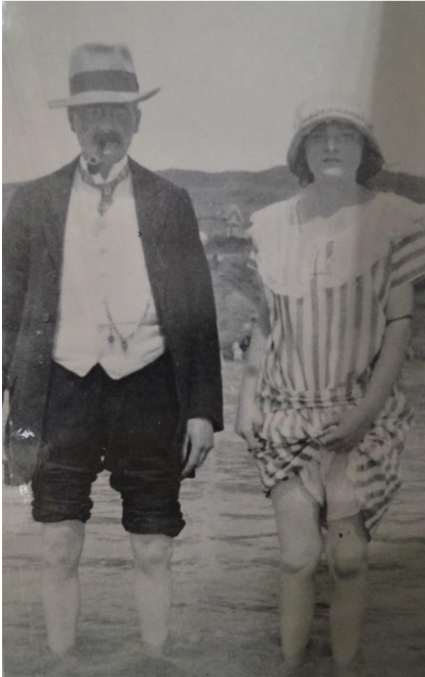
Combe Martin beach 1920's

Combe Martin has been a holiday destination for many years. Enjoy a selection of holiday photos from yesteryear. There are 2 beaches at Combe Martin the main one and the smaller Newberry beach.