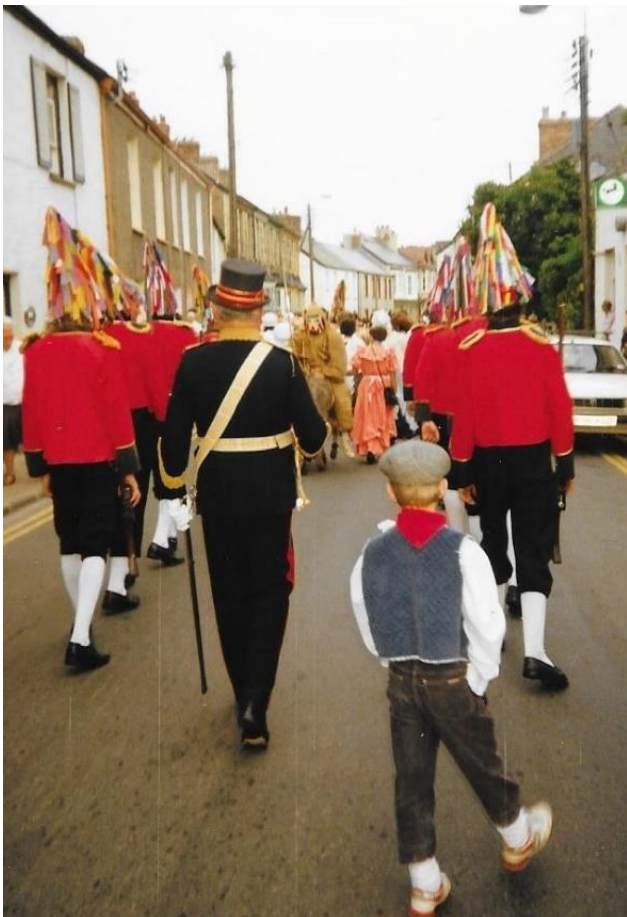
Grenadiers escorting Earl of Rone