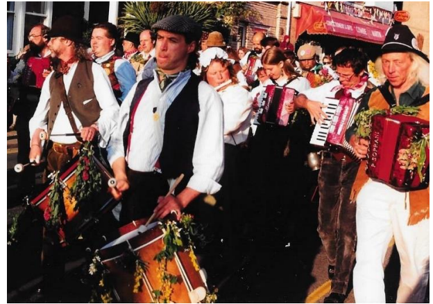
Drums and accordians