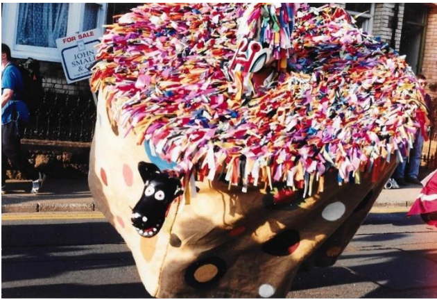
Hobby horse used in the Earl of Rone procession

It will be a quiet bank holiday weekend this year the village usually resounds to the sound of drums and accordions.